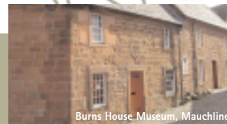
Burns House Museum, Mauchline