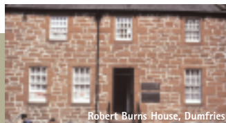
Robert Burns House, Dumfries