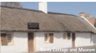
Burns Cottage and Museum